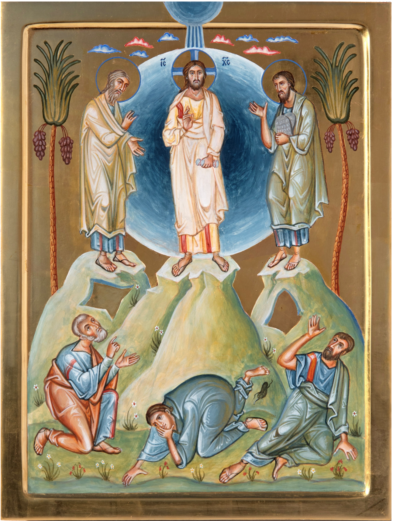
Figure 3. The Transfiguration of the Lord, affirming the incarnation, deification, the communion of the saints, and the transfiguration of the material world. (Icon and photograph by the author.)