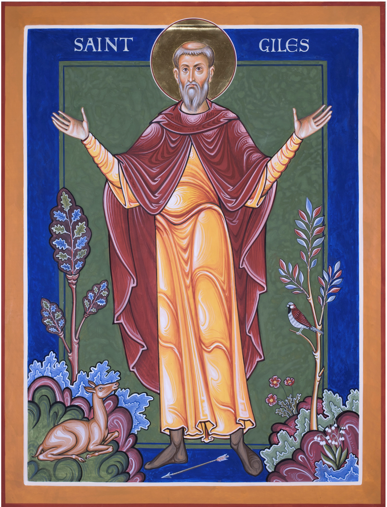
Figure 4. A Romanesque style icon of Saint Giles in the crypt of Canterbury Cathedral, in the Gabriel Chapel. (Icon and photograph by the author.)