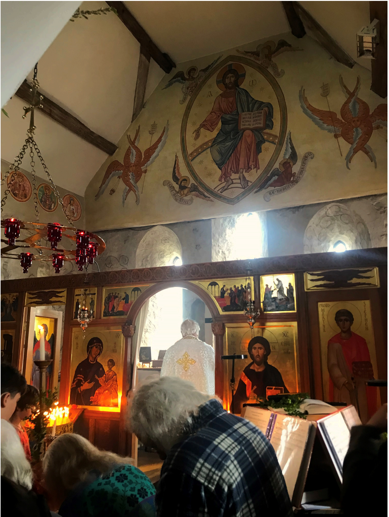
Figure 1. Iconography in its liturgical context at the Church of the Holy Fathers, Shrewsbury, UK.