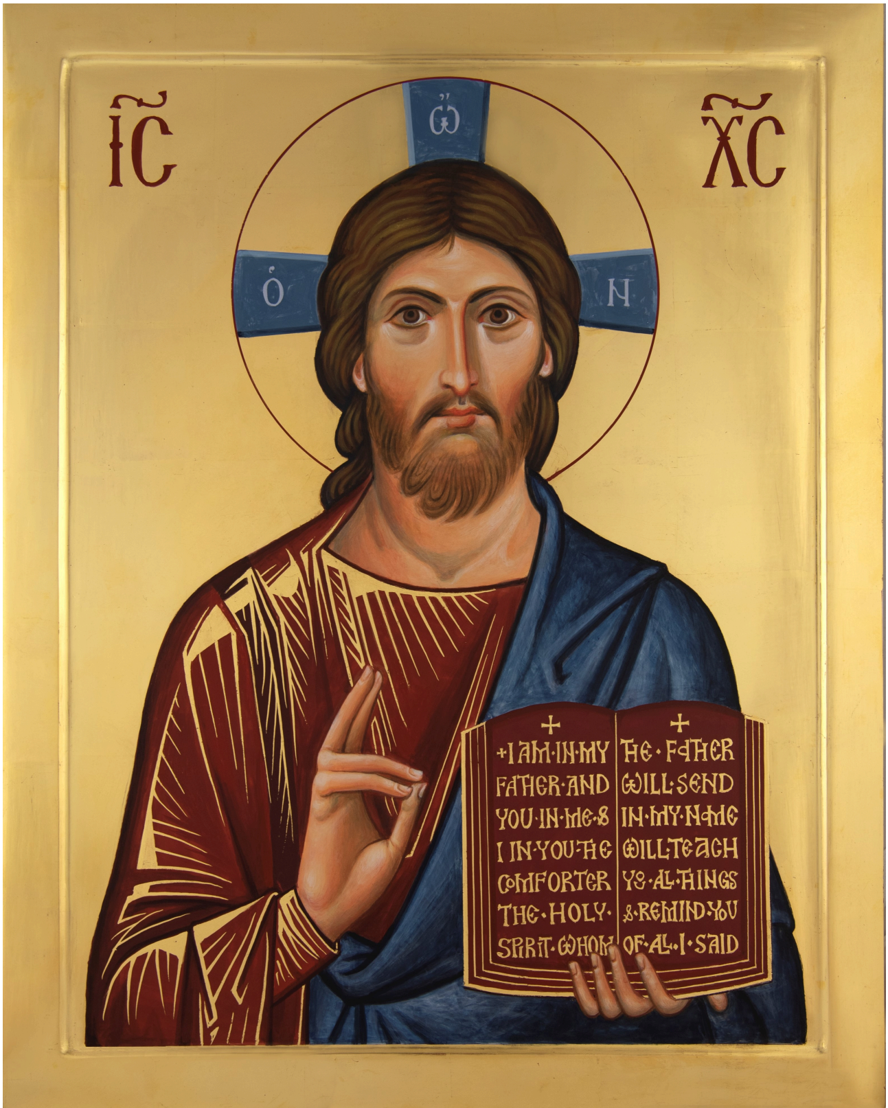
Figure 2. Icon of Christ the Saviour, showing the incarnation as the basis of the icon tradition; Holy Trinity Monastery, Crawley Down, UK. (Icon and photograph by the author.)